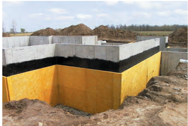
Professional installation by certified applicators guarantees a quality application of the J-Cote™ WB Waterproofing Membrane.

The J-Cote™ WB Waterproofing Membrane maintains a busy production schedule by being able to apply at temperatures as low as 0° F. The foundation can be backfilled as soon as 24 hours after application.