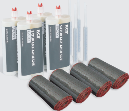
400 GSM Unidirectional Corner Wall Repair Kit