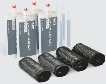
560 GSM Bidirectional Corner Wall Repair Kit

Kit Includes Four Carbon Fiber Straps that are 10 Feet Long!