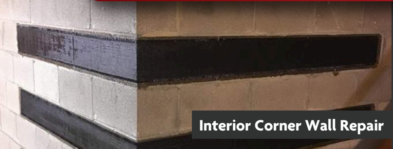
Interior Corner Wall Repair

ENGINEERED, TESTED AND QUALITY CONTROLLED | NEXT DAY SHIPPING