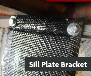
Sill Plate Bracket

ENGINEERED, TESTED AND QUALITY CONTROLLED | NEXT DAY SHIPPING