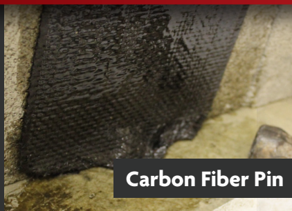
Carbon Fiber Pin